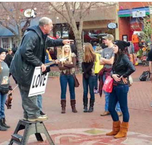
Freedom of Speech

Once a Constitutional amendment has been enacted, it becomes a permanent part of the Constitu-