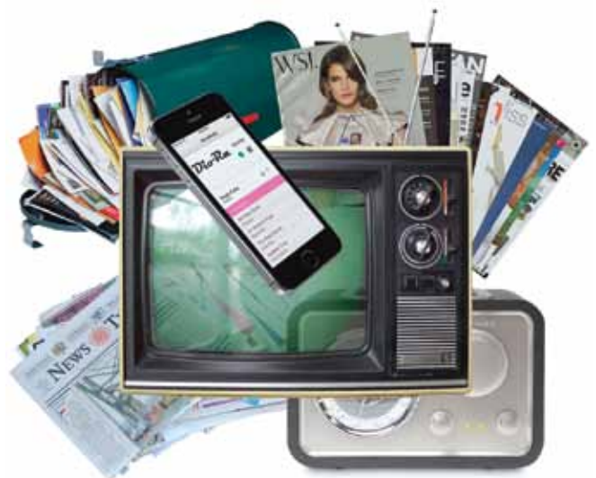
Reaching the Grassroots

Getting a two-thirds majority of the federal legislature to pass the Life Amendment is the first challenge to the Amendment program. In order to accomplish this, our entire nation must be made aware that an amendment is being sought. This information necessarily comes from America’s media. This includes newspapers, magazines, radio, TV, and the internet media sources. This looks overwhelming, but it is possible by starting with a determination to succeed.