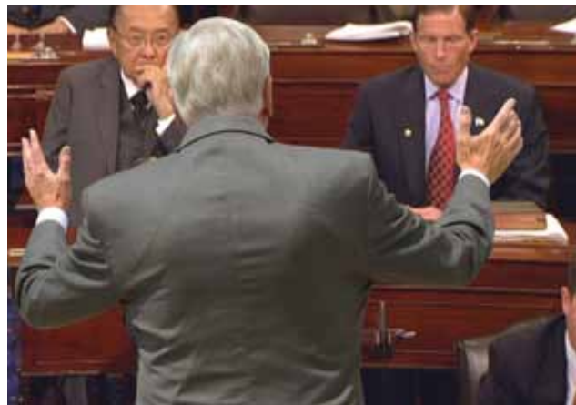
Introducing an Amendment

The essence of the Proclamation is recognizing the unborn human being as a person throughout pregnancy. When so recognized, existing Amendments 5 and 14 will protect the life of the unborn child. Amendment 5 says “No person shall be deprived of life without due process of the laws,” and Amendment 14 says “No state shall deprive any person of life without due process of the laws.” Crusade for Life’s proposed amendment offers the text