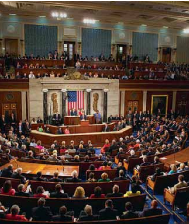
Joint Session of Congress

tures, or 38 states, must pass, or ratify, the amendment by a simple majority vote. At this point, the proposed amendment becomes an official part of the Constitution.