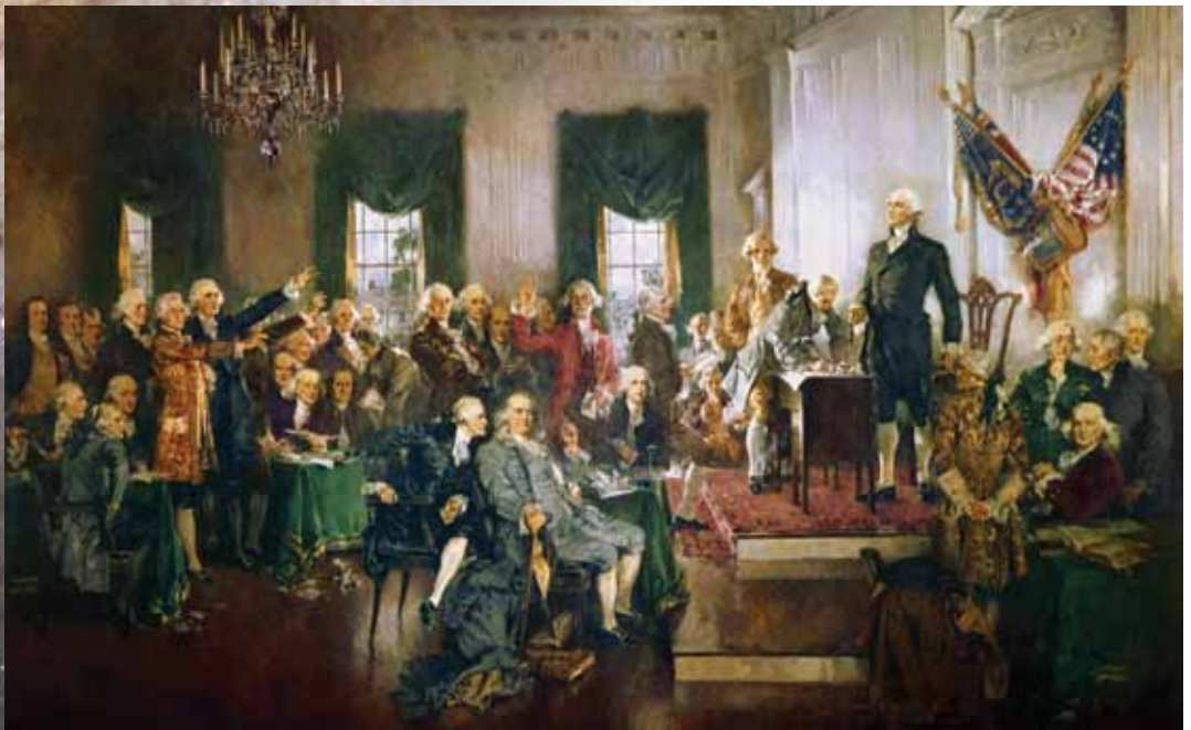
Signing of the U.S. Constitution